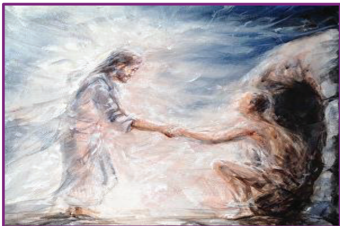
Jesus raises Lazarus