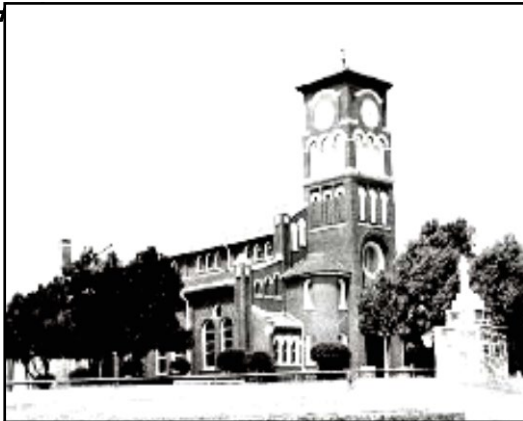
St. Mary Catholic Church Windthorst, TX