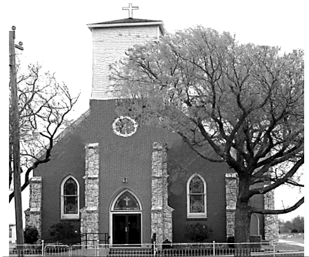
St. Boniface Catholic Church Scotland, TX

To serve Christ and promote His teachings through Worship, Education, Training, Service, and Community Involvement