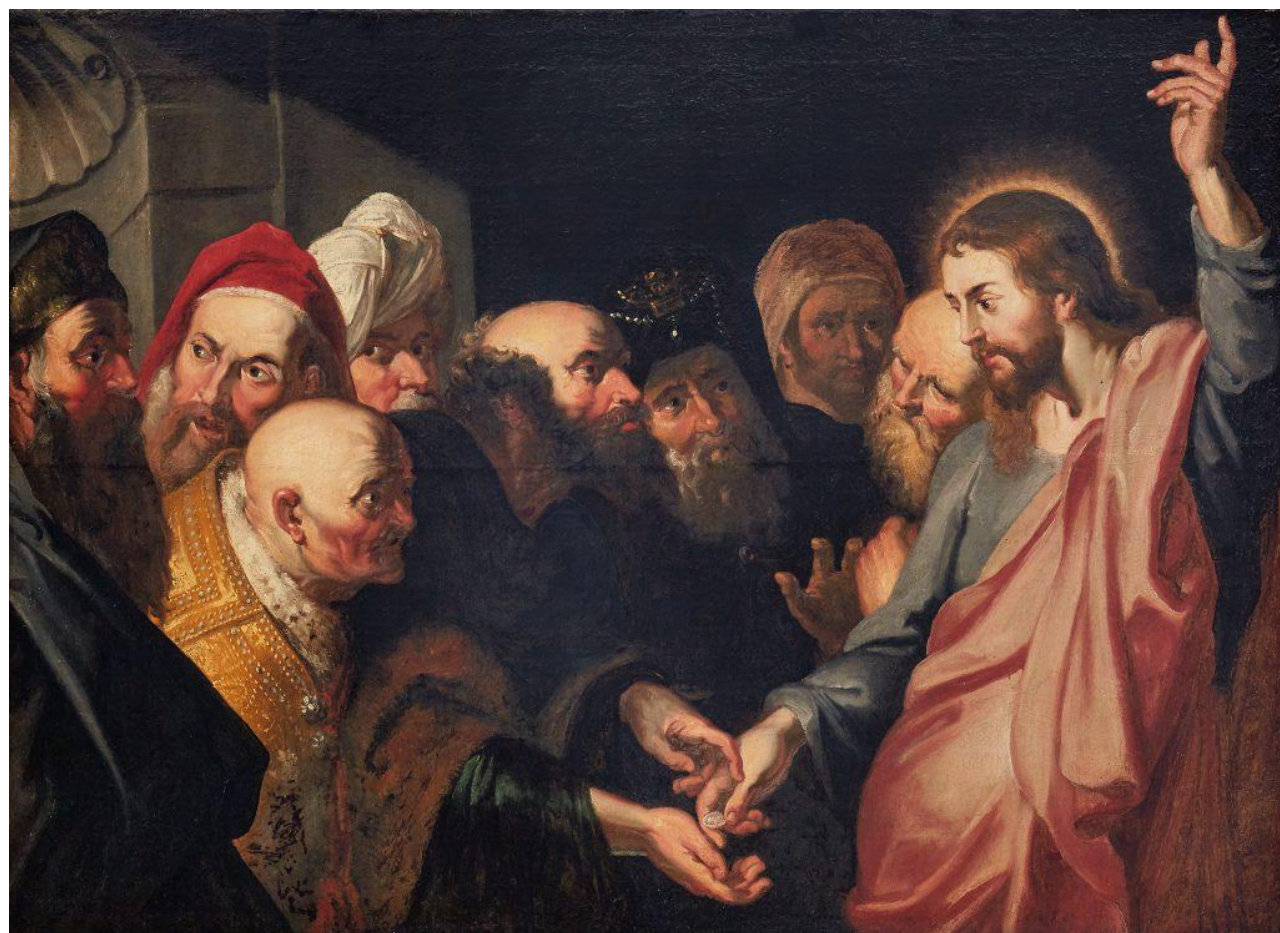
"Caesar's Coin" by Peter Paul Rubens