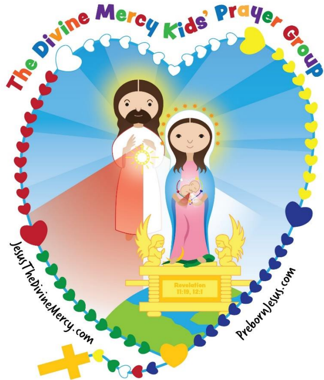
The Divine Mercy Kids' Prayer Group Happy Saints

Mary is the Mother of everyone. God wants His graces and mercy to flow through His dearly beloved Son, Jesus, and through His Mother, Mary, Ark of The New Covenant, to the whole world.