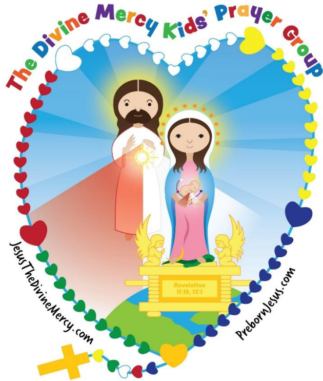
The Divine Mercy Kids' Prayer Group Happy Saints

Mary is the Mother of everyone. God wants His graces and mercy to flow through His dearly beloved Son, Jesus, and through His Mother, Mary, Ark of The New Covenant, to the whole world.