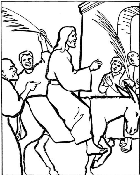
Jesus rides into Jerusalem on a donkey. The people receive Him as their king. Matthew 21:8, 9