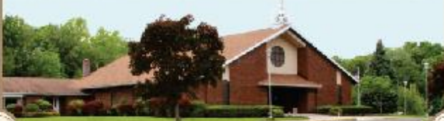
ഈ ദിവസങ്ങളിൽ സമർപ്പിക്കുകയും പ്രാർത്ഥിക്കുകയും ചെയ്യുക.

ഇതുകേൾക്കുന്നവരേ, ഞങ്ങളെ അനുഗ്രഹിക്കണമേ. വിശുദ്ധ യോഹാൻസ്സാലയ ഞങ്ങൾക്ക് വേണ്ടി അപേക്ഷിക്കണമേ. വിശുദ്ധ അൽഫോൻസാലയ ഞങ്ങൾക്ക് വേണ്ടി അപേക്ഷിക്കണമേ.