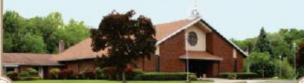
Keep this at home and pray.

Holy family of Jesus, bless us St Thomas, pray for us St. Alphonsa, pray for us.