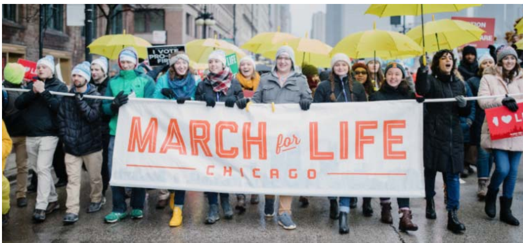
The 2020 March for Life Chicago drew 9,000 people to the annual rally in Downtown Chicago, and 2,000 people to an associated convention.

After growing its pro-life event from 150 people to 9,000 in under 10 years, the March for Life Chicago will hit the road in January 2021 with a ‘Moving the Movement’ tour with stops in seven cities across five Midwestern states.