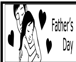
© J. S. Paluch Co., Inc.

One father is more than a hundred schoolmasters.