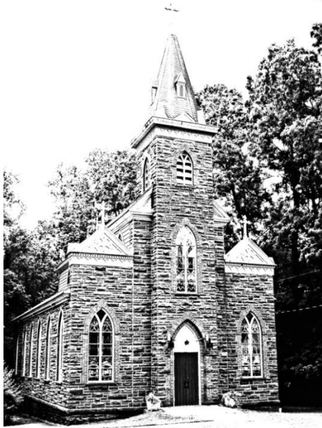
Gem of the Catskills