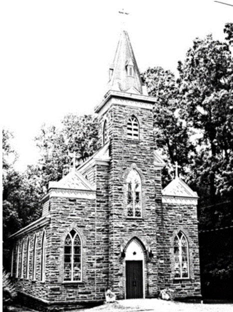
Gem of the Catskills