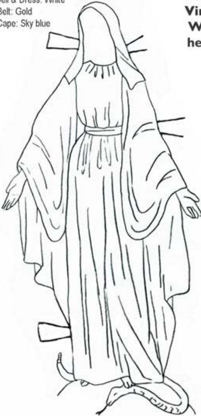
Our Lady of Grace Veil & Dress: White Belt: Gold Cape: Sky blue

Our Mother, the Blessed Virgin Mary, is only one. Would you like to dress her with the advocacy you like the most.