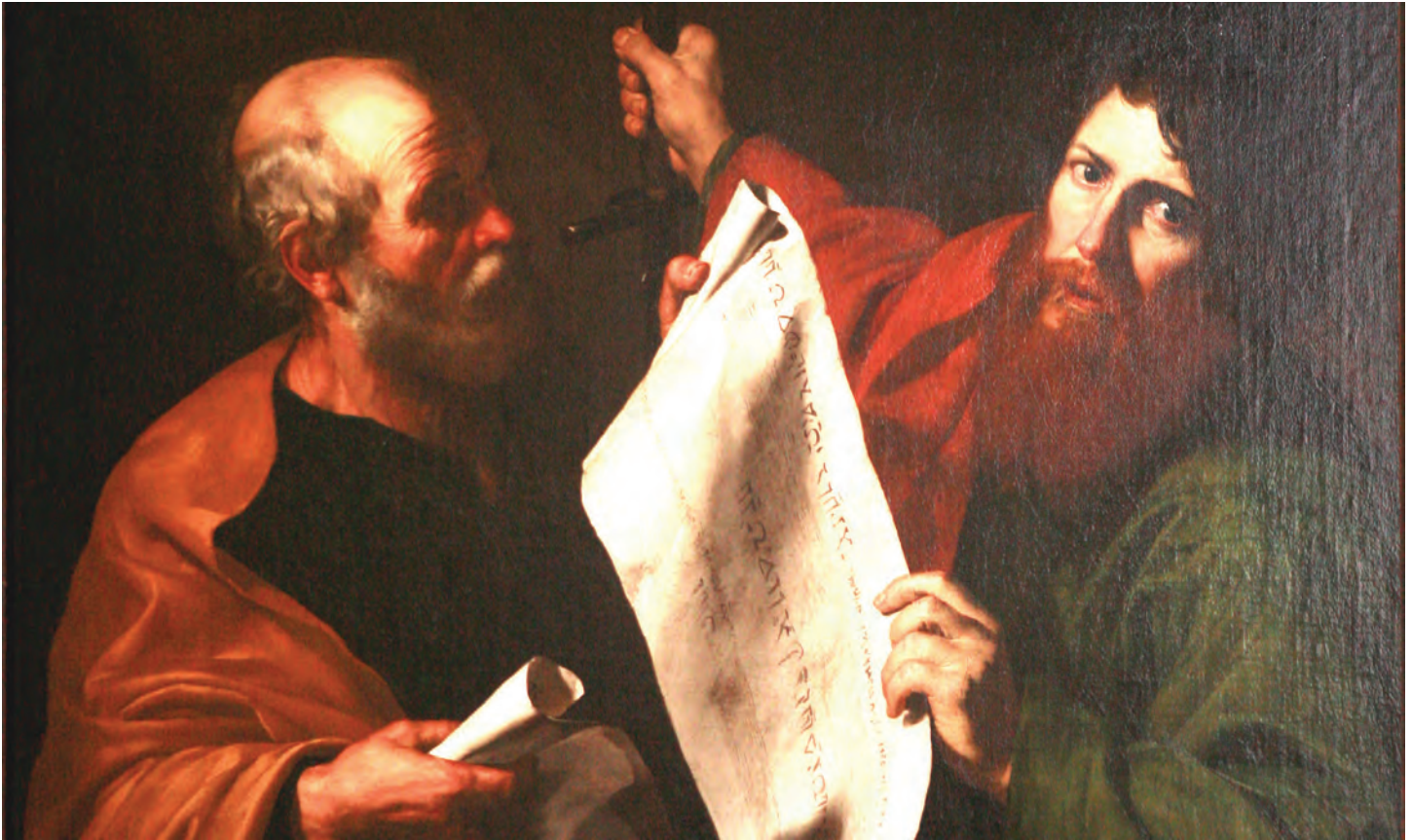
Jusepe de Ribera (1591-1652), Saint Peter and Saint Paul We celebrate these two great apostles together on June 29.

www.sjegoshen.org ~ Tel: 294-5328 ~ office@sjegoshen.org