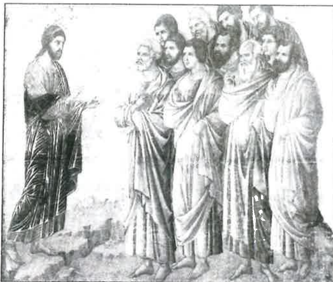
DUCCIO di Buoninsegna, Appearance on the Mountain in Galilee, 1308-11