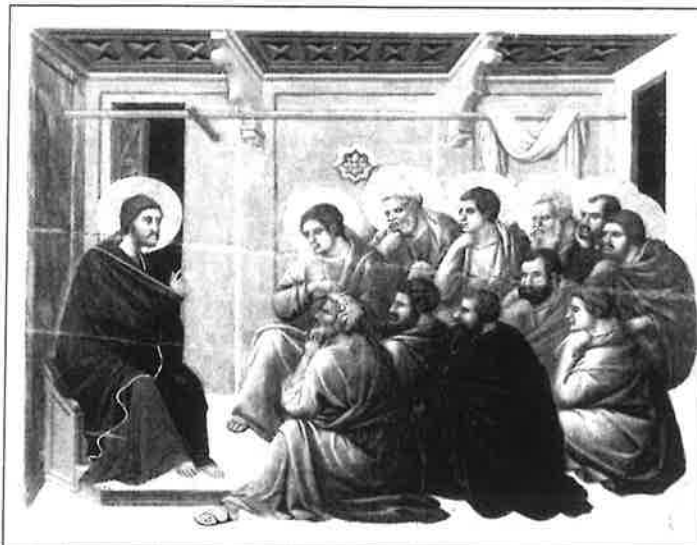
Duccio di Buoninsegna, Christ Taking Leave of the Apostles, 1308-11