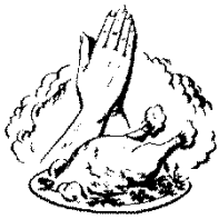
Thanksgiving