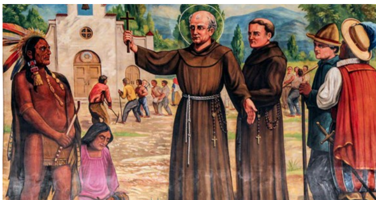
St. Junipero Serra (1713-1784)

This Wednesday is the feast day of Junipero Serra the great Franciscan missionary, canonized on September 23, 2015, by Pope Francis. In California a statue of him was pulled down by vandals. These people are ignorant of history and are evil. The anarchy going on in our country that is supported by liberal political elements is nothing less than an attack on Western Culture, and specifically the Catholic Church. These groups are anti-life anti-family. They are pro-abortion, pro-sodomy, and pro-socialism/communism, as their own documents state. As St. Paul wrote to the Ephesians: