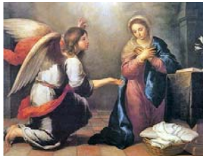
The Annunciation by Bartolomé Estéban Murillo

On the Solemnity of the Immaculate Conception, December 8, 2007, the John Paul II Centre for Divine Mercy was consecrated to Our Blessed Mother under the mantle of the Immaculate Conception.