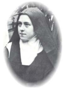
St. Therese of Lisieux The Little Flower

(The above prayer, plus 3 Our Father's 3 Hail Mary's and 3 Glory Be's, must be said on 9 successive days.