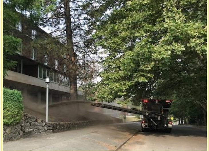
A remote-controlled truck supplies our side-terraces with fertile soil to prepare for landscaping.

Our summer projects are moving along swiftly and with great enthusiasm. We continue to depend on your support to complete our various projects. Thank you for your assistance in seeing these projects to completion. The responses to recent updates in the church has been overwhelmingly positive, and for this we are grateful.