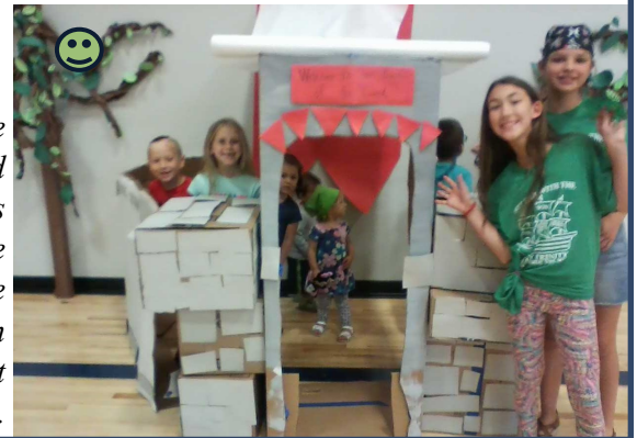
St. Augustine volunteers and VBS campers play in the “Castle of the Lord” after a fun day with Saint Patrick.

Last week, 151 children gathered at Our Lady of Fatima Parish to learn about the adventures of St. Patrick and the mysteries of the Holy Trinity. The campers had a blast, as did the volunteers. Thanks to everyone who helped make this year’s VBS a success!