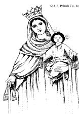
Our Lady of Mount Carmel

On Sunday, June 7 , our traditional procession in honor of St. Anthony and Our Lady of Mount Carmel will process, accompanied by a band, immediately following the 12:00 Noon Mass. A special invitation is extended to the children of our REP and school to walk in the Procession. Children who received their First Holy Communion this year may honor our Lady of Mount Carmel and St. Anthony by wearing their Communion outfits as a symbol of their innocence and their closeness to God.