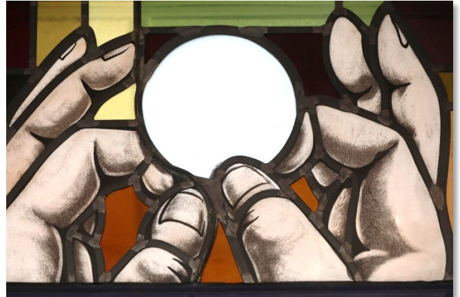
Elevation of the Eucharist is depicted in a stained-glass window at St. Anthony's Church in North Beach, Md., July 15, 2021.